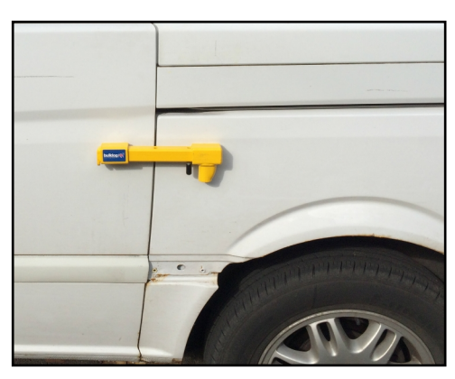
Fitted to rear of side door