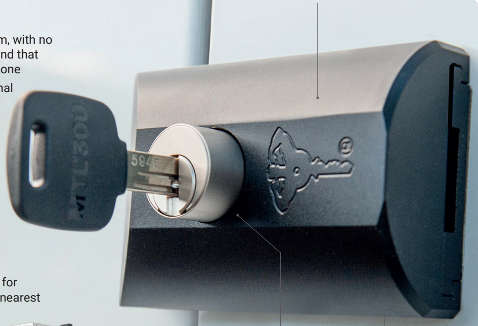
High quality non-corrosive anodised lock body